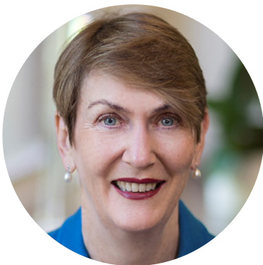
The Honourable Anne Ferguson Chief Justice of Victoria

It is a pleasure to present the 2022-23 Annual Report for the Supreme Court of Victoria. The Court operates for all Victorians. The work of the Court reflects many of the events, changes and challenges we face. As a court, we seek to adapt our operations to meet the needs of the community as they change over time. The 2022-23 Annual Report is a reflection of this.